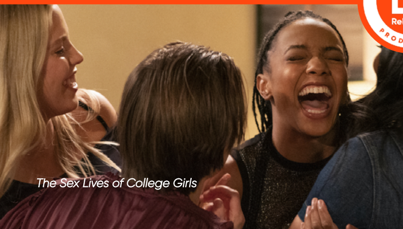
The Sex Lives of College Girls